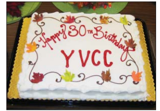
A special cake marks the 30th anniversary of Yellowstone Valley Citizens Council.

diners also wrote more than 50 letters to Senators Tester and Baucus encouraging them to amend a new piece of federal legislation in order to protect small direct-market farms and local-market processors.