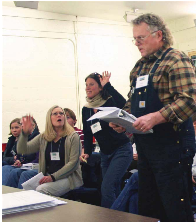
Participants practice new skills in role play exercises during WORC's Principles of Community Organizing training. A workshop will be held June 23-26 in Billings.

■ The federal Office of Surface Mining is reviewing its state oversight policies, and WORC submitted comments to improve the policies, particularly on bonding levels and funds for water reclamation.