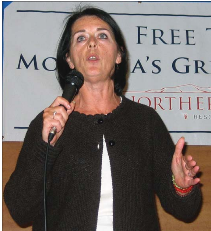
Lois Gibbs is founder and executive director of the Center for Health, Environment & Justice. This organization successfully forced McDonald’s to stop using Styrofoam packaging (as has Burger King and Wendy’s) and recently convinced Microsoft to stop using highly toxic polyvinyl chloride (PVC) in its packaging and products. Target, Wal-Mart, Kmart, and Sears have followed suit. To learn more about the center’s campaigns, visit its website at www.chej.org

“When I read this report, I was furious,” said Gibbs. The report offered remedies, but failed to