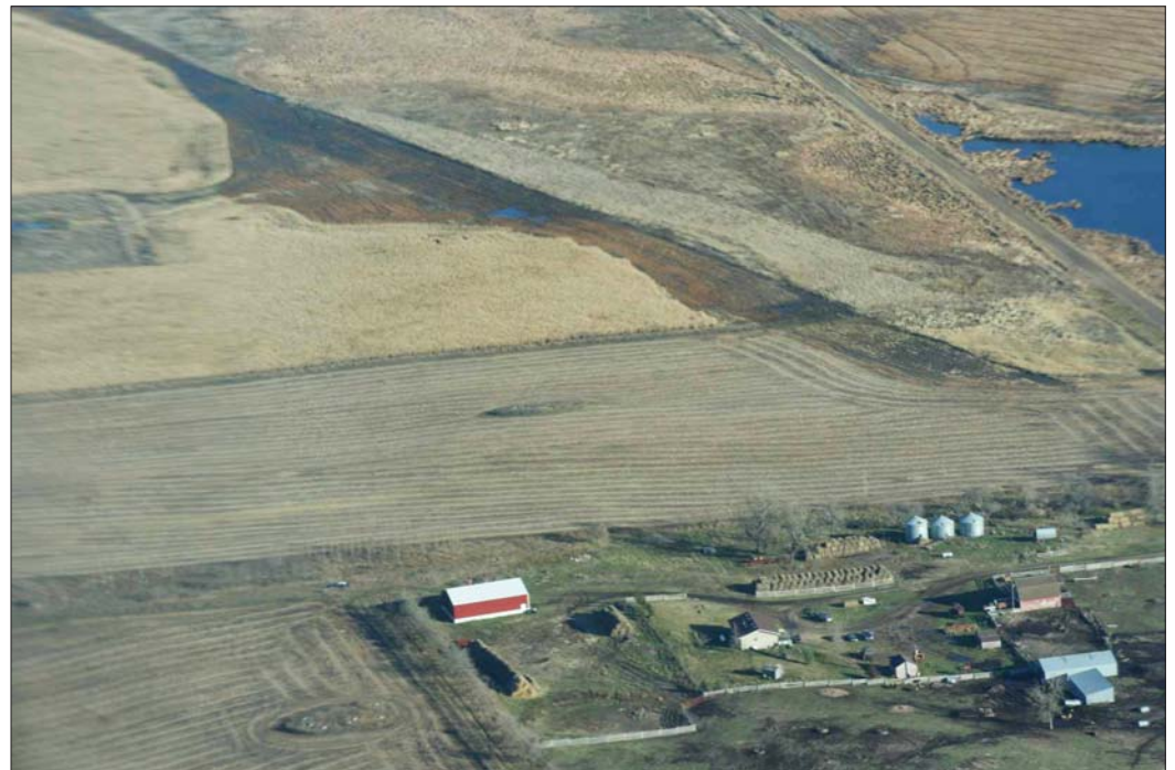
The Keystone 1 Pipeline route can be seen cutting through a farm in eastern North Dakota.

The Northern Plains Pipeline Landowners Group continues to grow in size and is currently developing contract language for landowners to negotiate as a bloc with TransCanada.