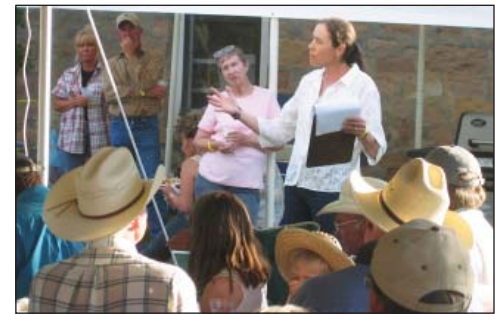
Grassroots organizing: It's what we do at Northern Plains Resource Council.